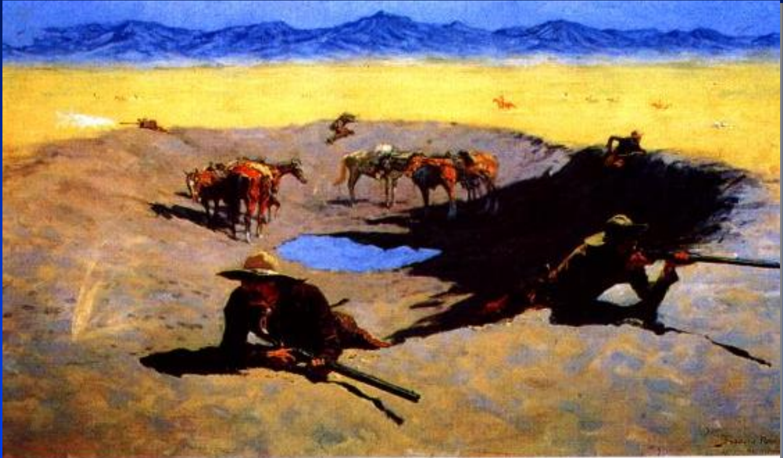
Fight for the Waterhole , by Frederic Remington; The Museum of Fine Arts, Houston; The Hogg Brothers Collection, Gift of Miss Ima Hogg